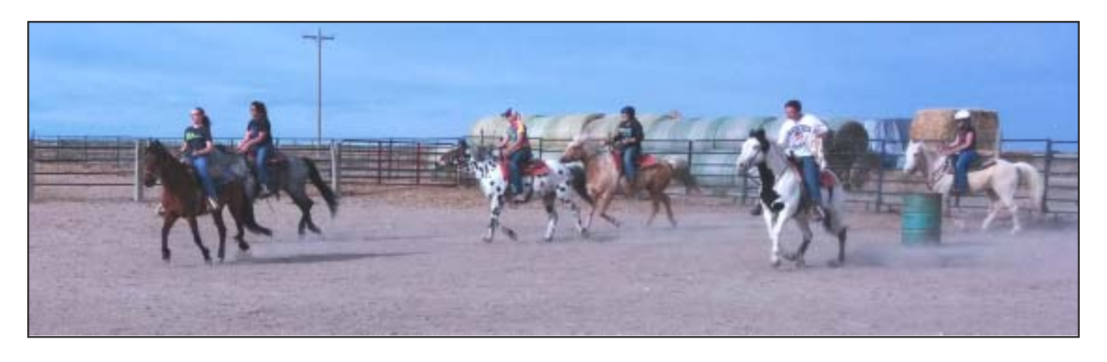
Youth counselors in a rousing game of "Goat Carcass". Goal is for your team to score points by grabbing the goat carcass (bag of sand) and fighting through the defense to place the bag on the opposing team's barrel.