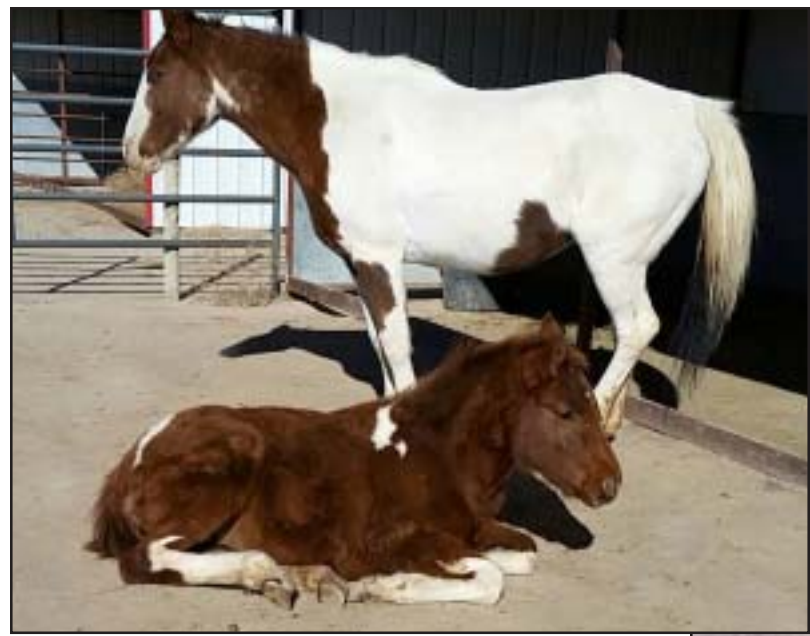
Catalina and Titan