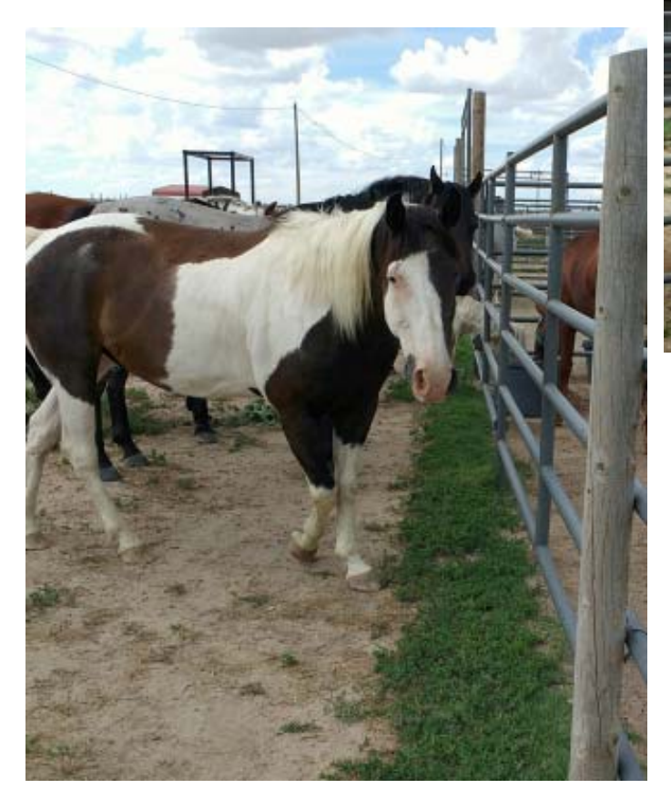
Tee is a handsome paint who was boarded at Blue Rose Ranch years ago. His owner needed to move and could not take him. We are happy to have Tee back at Blue Rose Ranch.

Zippy is an award winning performance horse. Zippy is now older and no longer performing. His first friend at Blue Rose Ranch was Preceptor, the statue that stands watch at the entrance to the ranch.