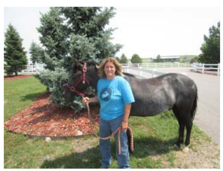
Cabo is adopted and living in luxury in Highlands Ranch. He is used on trail rides and in kids programs. Cabo was just the right size and has just the right amount of spunk!