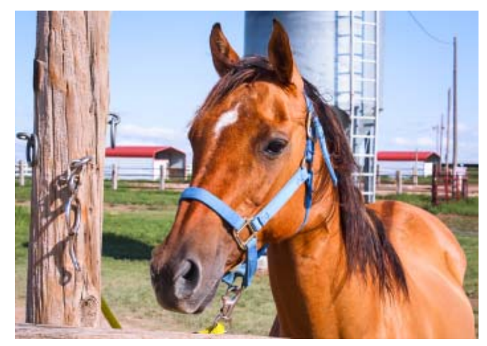
Dixie is a sweet mare. Her previous family loved her, but Dixie needed a place with greater horse experience.