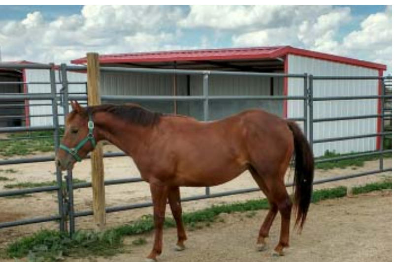
Lucky was abandoned in a remote rural location. He is thrilled to be at Blue Rose Ranch where he has lots of attention and many horse friends. Lucky was lost, now he is found.