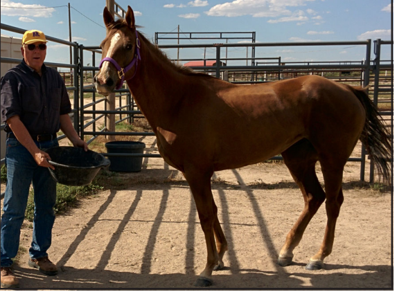
Clementine - the day she arrived, receiving her first dose of antibiotics.