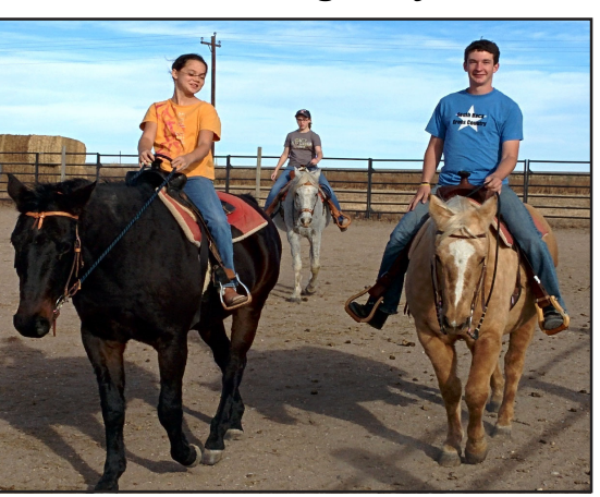
Vector, Lady and Ahab, along with some of our youth riders.